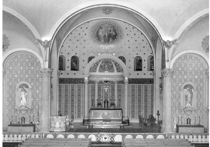
A look back at the interior of our church from the 1950's to the mid 1970's

Prayer: Lord Jesus, you made the deaf to hear and the dumb to speak. Open my ears to hear your word and my mouth to declare your praise. Amen!